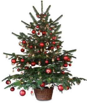
A CHRISTMAS TREE