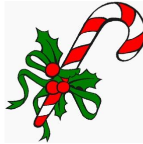
A CANDY CANE