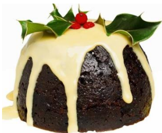
A CHRISTMAS PUDDING