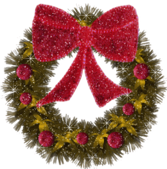
A CHRISTMAS WREATH