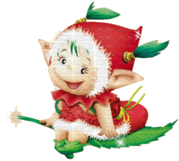
A CHRISTMAS ELF