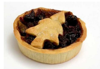
A MINCE PIE