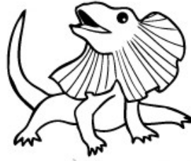
LÉZARD À COLLERETTE lézard à collerette