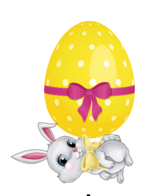
under the egg