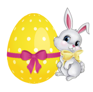
by the egg