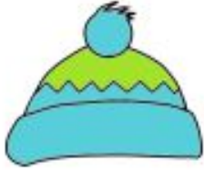
a woolly hat