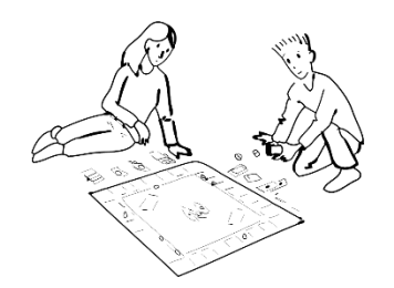
I play with my friends