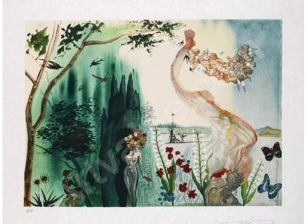
Le printemps (S. Dali - 20 ème siècle)