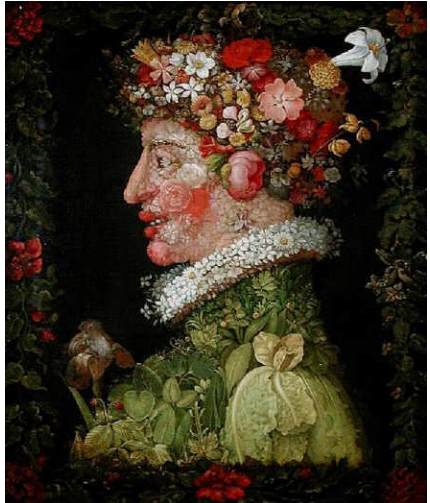
Le printemps (Arcimboldo - 16 ème )